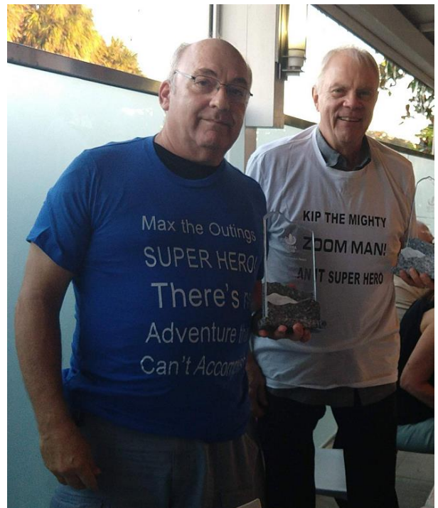
More pictures on our Facebook Page .