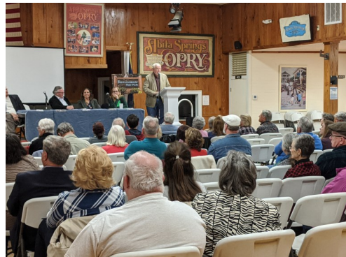
Nov. 8th Forum, Abita Springs