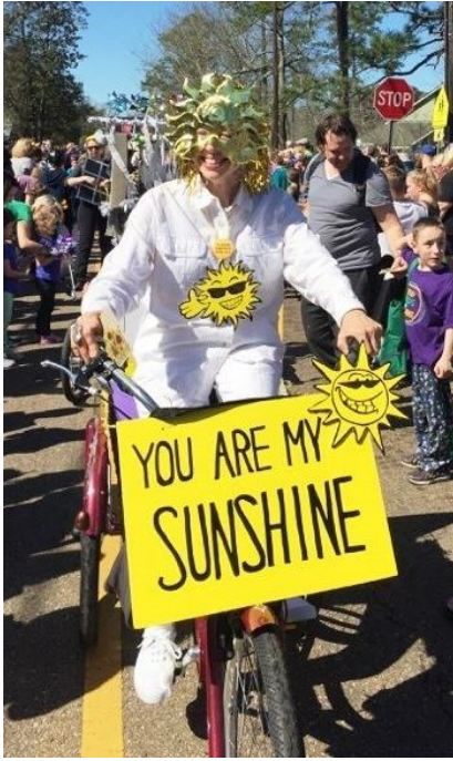
Ready For 100 volunteer in Abita Springs 2017 Push Mow Parade.