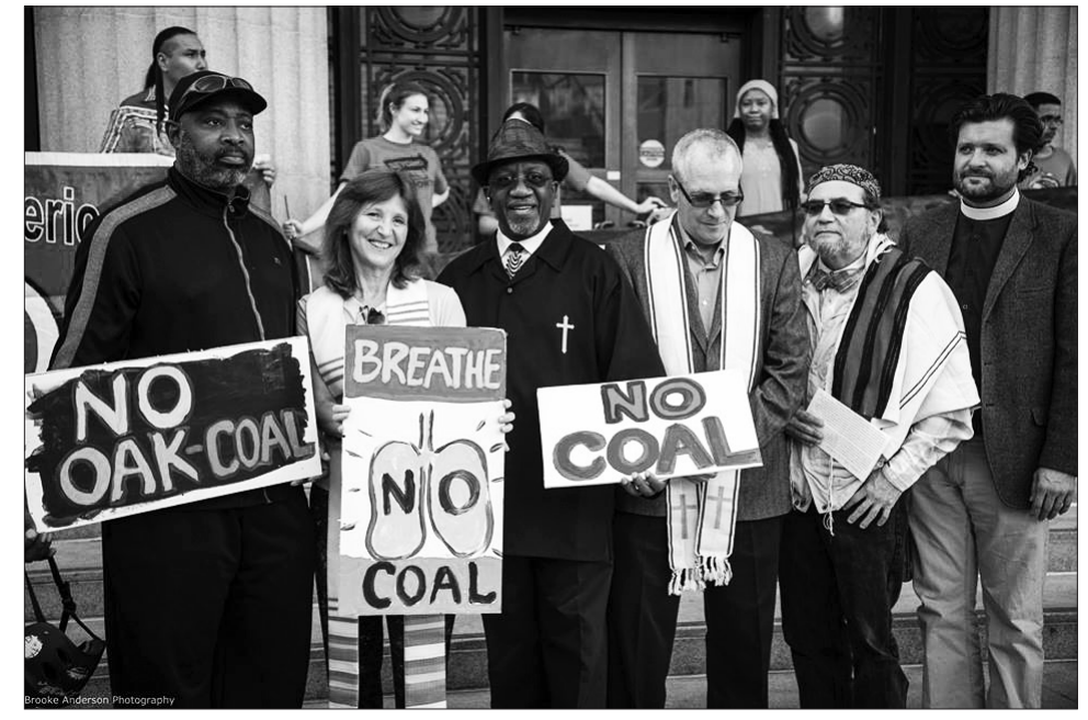
Local leaders from diverse faith communities came together at the February 16th city council meeting to oppose the proposal to export coal through Oakland. They called on the council to protect their communities by standing up to out-of-state coal companies.

While the city council continues to delay action, the developers and coal interests are