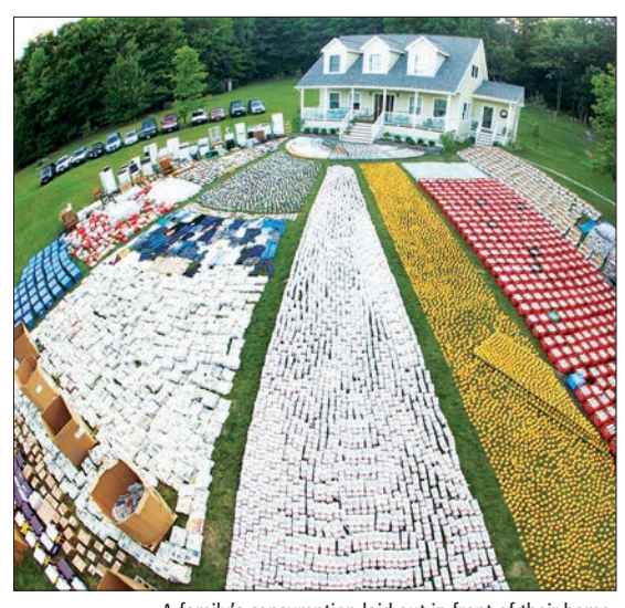
A family's consumption laid out in front of their home

Afterward, we will discuss our own personal footprints and ways we can begin to minimize our impacts. From birth to death we consume enormous quantities of natural resources and produce equally enormous quantities of waste. From food to clothes, cars and energy, housing and plastics, our impact is astonishing. Human consumption and pollution of planetary resources is the fundamental environmental problem of our time.