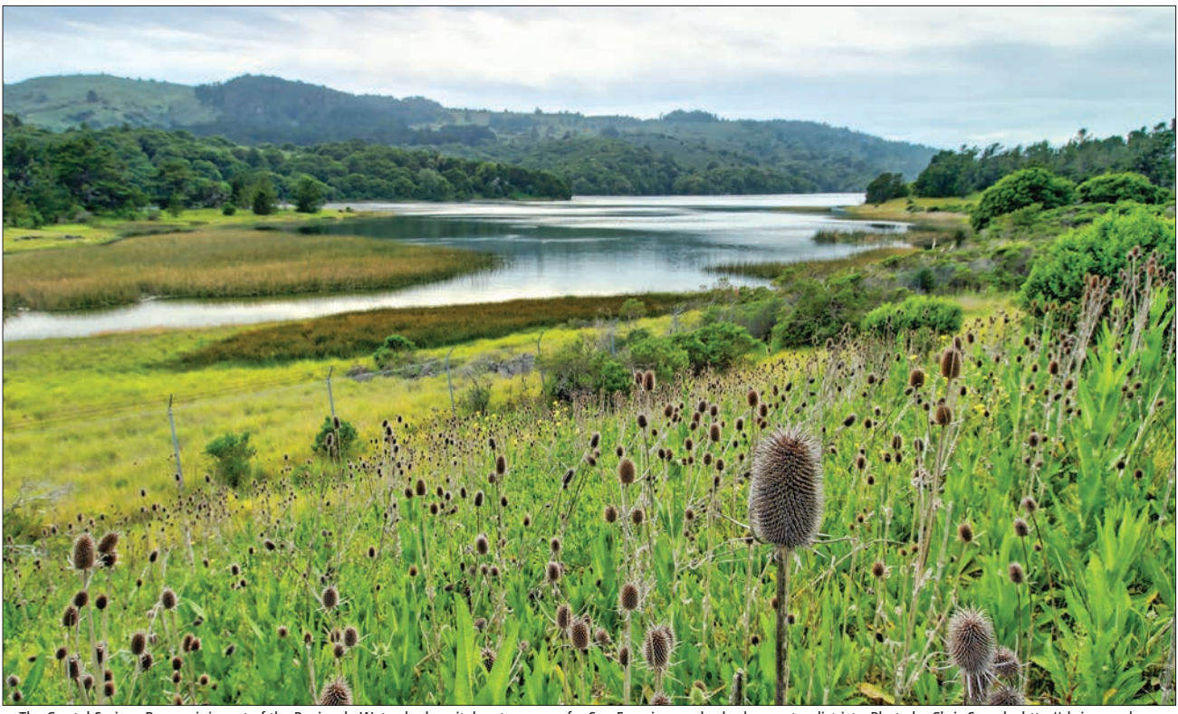
The Crystal Springs Reservoir is part of the Peninsula Watershed, a vital water source for San Francisco and suburban water districts.

Allowing uncontrolled access to the watershed's remote areas would tremendously increase costs to taxpayers, as people will inevitably trespass into protected, sensitive areas. Fencing to prevent access would interrupt established wildlife migration