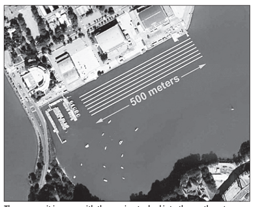
The cove as it is now, with the marina tucked into the northeast corner and the dragon boating racecourse marked with lines.

feet and two finger docks per slip. The marina would also provide docking for mega-yachts up to 175 feet in length. In contrast, South Beach