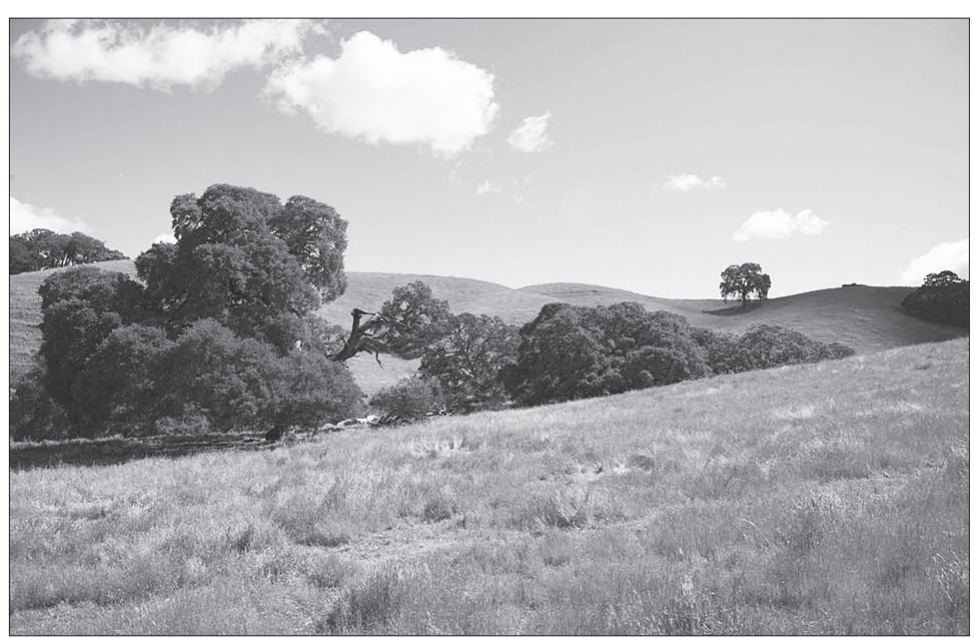
The site of the proposed Lund Ranch development.