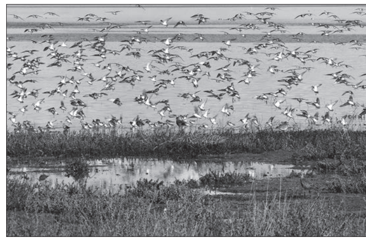
Migrating birds flock by the thousands to Hamilton Wetlands.

Novato City Councilmembers: City of Novato, 922 Machin Avenue, Novato, CA 94945