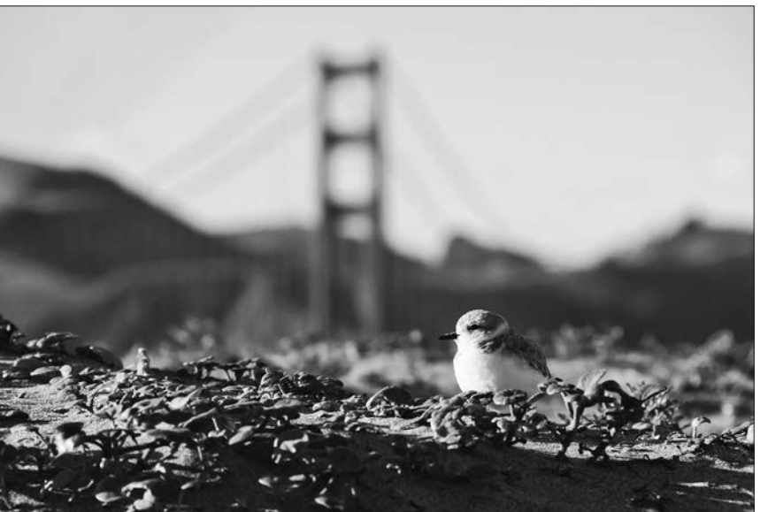
The proposed rule will protect habitat for threatened species such as the western snowy plover, shown here at the GGNRA.

At Ocean Beach, off-leash dogs have disturbed threatened snowy plovers, upsetting nests, frightening away protective parents, and leaving eggs and chicks exposed to the cold and to predators. Only 2,100 birds remain on the entire Pacific coast, and Ocean Beach is the plover's most important nesting