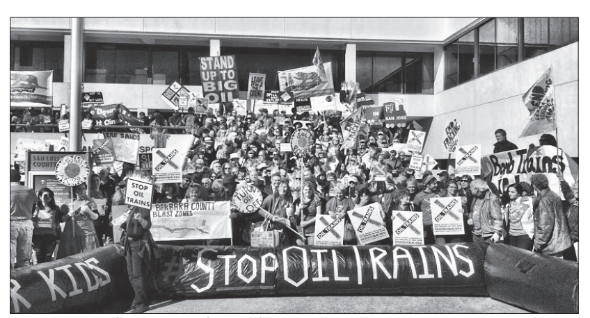
Hundreds gathered for a rally on the first day of hearings.

were outnumbered by people urging the Planning Commission to deny the project. This imbalance is nothing new. Of the approximately 24,500 comment letters received on the project during the environmental review process, only about 150 were in support. The county has also received dozens of comments from state and local governmental officials, counties, cities, schools and fire protection