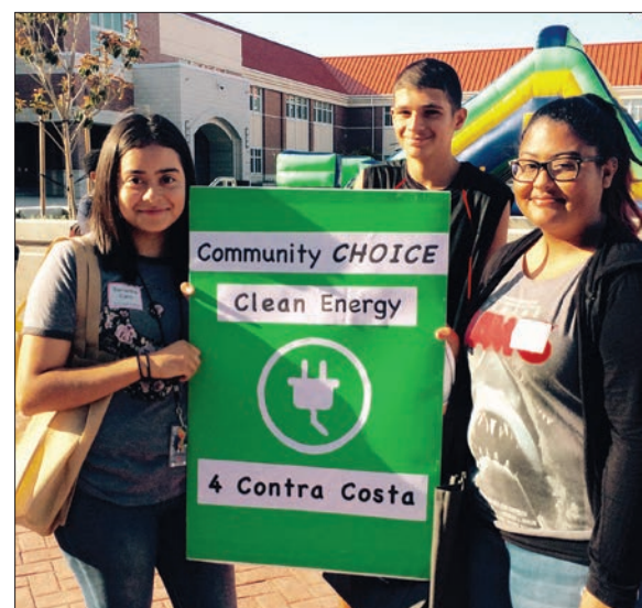
Pittsburg students in support of Community Choice.