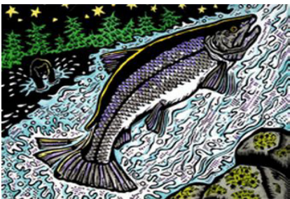
Salmon: Evon Zerbetz © 1996

The Pedro Bay Corporation is an Alaska Native group that owns land near Bristol Bay in Southwest Alaska, the site of the most prolific sockeye fishery in the world. Their land is located at Lake Iliamna, just where the backers of the proposed Pebble Mine hope to build a road to transport