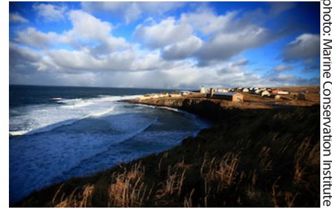
St. George, Pribilof Islands

https://unangansanctuary.net/about-national-marine-sanctuaries/ . ❖