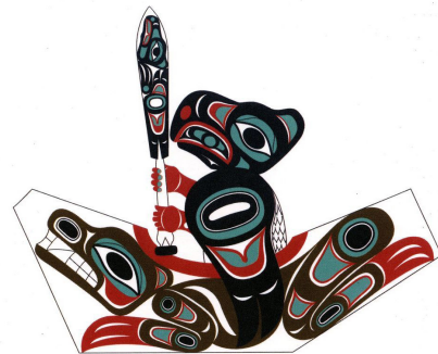
Eagle and bear canoe © Israel Shotridge