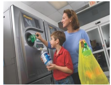
A reverse vending machine

The program would be operated by a nonprofit Beverage Container Stewardship Organization representing all producers that sell beverages in the state. MDE would select the Organization and provide substantial oversight, approving stewardship plans and annual reports and setting the program's convenience standards and handling fees. An Advisory Council of stakeholders would advise MDE on plan approval, implementation, and performance. The program would be self-financing from fees paid by producers, revenue from the sale of raw materials, unclaimed deposits, and penalties. Ten percent of unclaimed deposits would fund a Grant Program to increase the reuse and recycling of beverage containers.