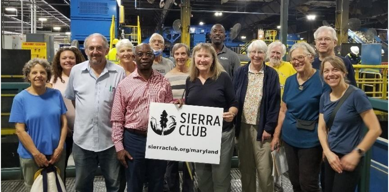
Tour of the Prince George's County single-stream Materials Recycling Facility, September 2024

Advisory Council for the Extended Producer Responsibility for Packaging bill. In October, twenty-six participants joined us to tour the County's Organics Composting Facility, including contingents of Sierra Club members from the DC Chapter and the Greater Baltimore Group. The Team tabled at Bowiefest in June and the Prince George's Green Summit in October, featuring a "recycling challenge" for visitors, information on the effectiveness of the Better Bag Bill, and a display on the need for a Maryland Bottle Bill.