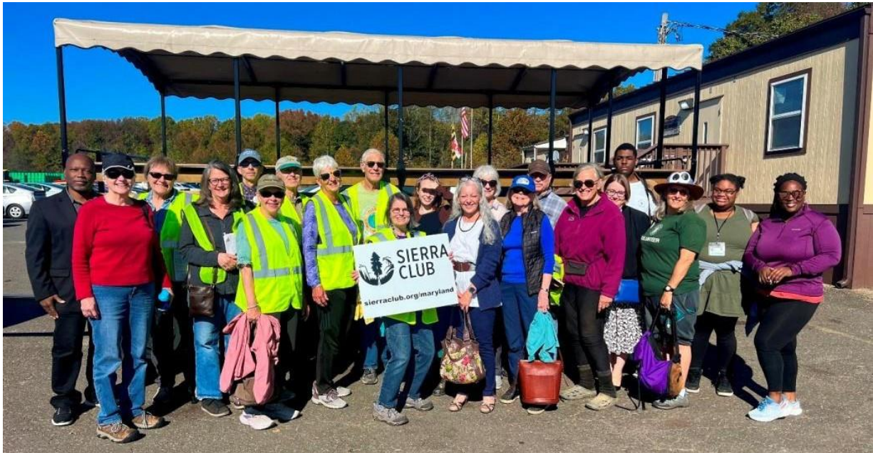
Tour of the Prince George's County Organics Composting Facility on October 23, 2024