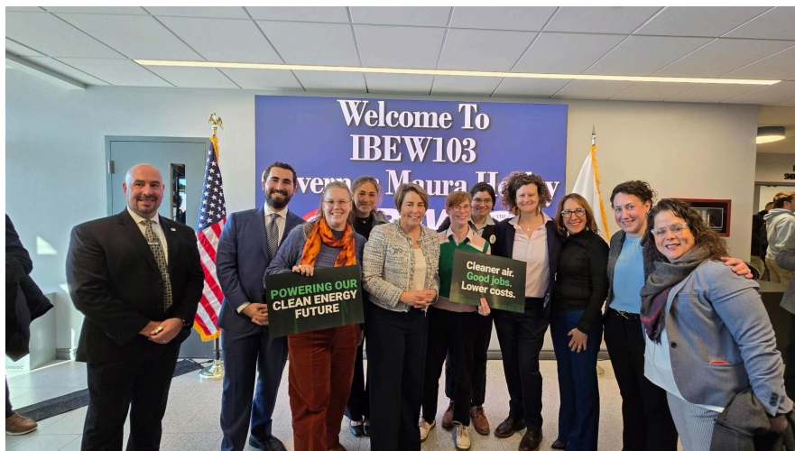
Advocates and partners standing with Governor Healey at the bill signing ceremony on Tuesday.

Governor Healey has now officially signed the 2024 Massachusetts Climate Bill into law, An Act promoting a clean energy grid, advancing equity, and protecting ratepayers. Looking toward the new year, we will continue to work to ensure all provisions are implemented with the least impact on communities and our natural environment.