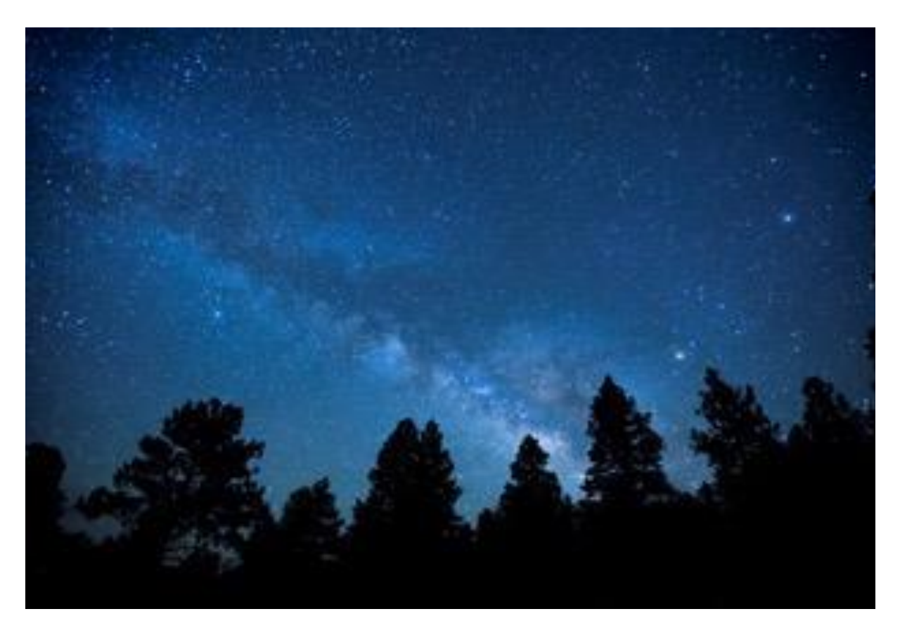
Every Day Needs a (Dark) Night