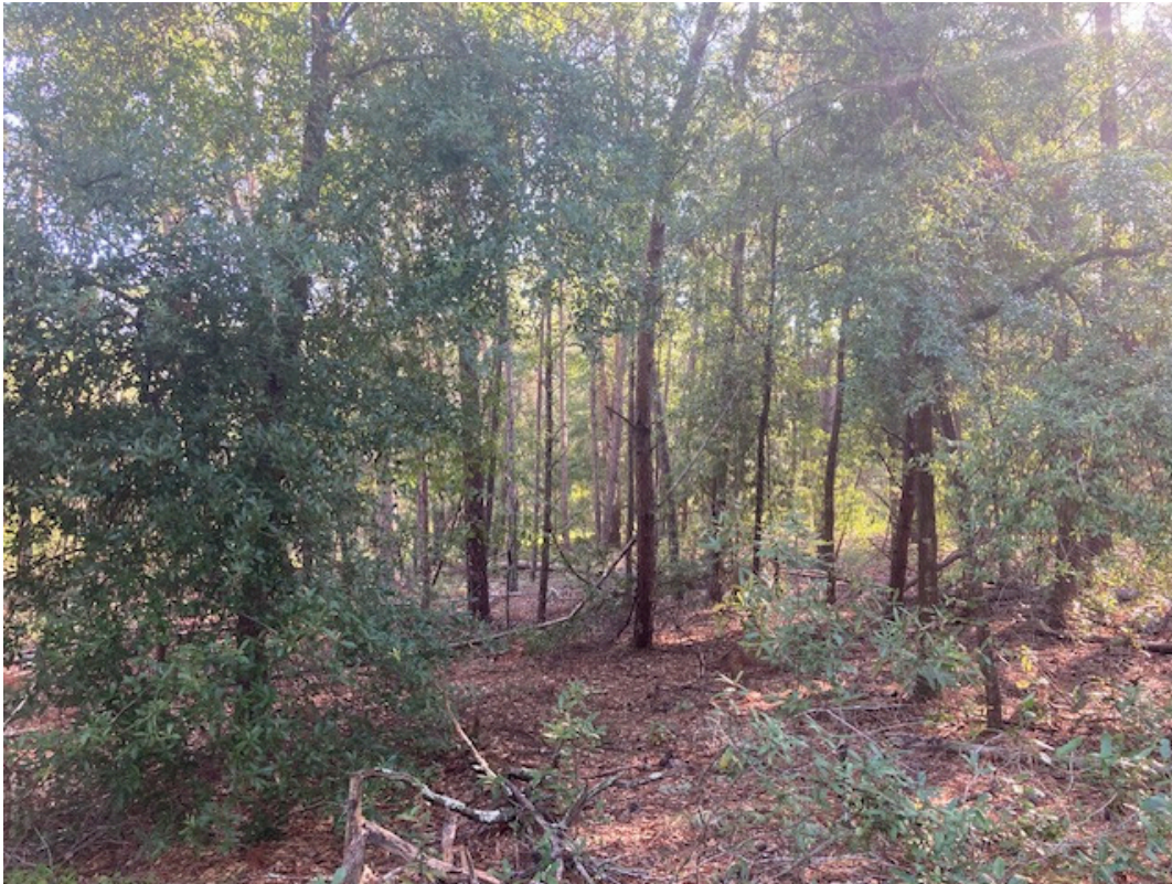
Withlacoochee State Forest parcel earmarked for land swap

This past June, without any public input, nor any discussion on the part of its members, the Florida Governor and Cabinet voted to approve transfer of 324 acres of land within the Withlacoochee State Forest in Hernando County to Cabot Citrus OpCo LLC, a Canadian corporation, to expand its adjoining luxury golf course/resort development in exchange for 861 acres of pine plantation in Levy County. It had obtained approval earlier from the Hernando County Commission to build 1770 residential units and a large area of commercial development on the land it already owns adjacent to this part of the Withlacoochee State Forest.