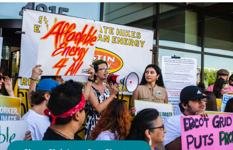
Sierra Club Lone Star Chapter

We oppose efforts to further subsidize fossil fuel plants through state-backed incentives or capacity market schemes. One of our goals is to increase grid resiliency measures at private and public utilities to help Texans survive weather extremes, including Backup Power Packages approved by voters in 2023 as a part of the Texas Energy Fund (TEF). The TEF was created by the Texas Legislature through Senate Bill 2627 and provides funding opportunities for electric generation projects through four programs.