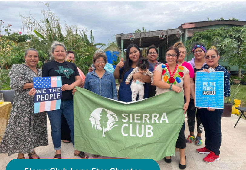
Sierra Club Lone Star Chapter