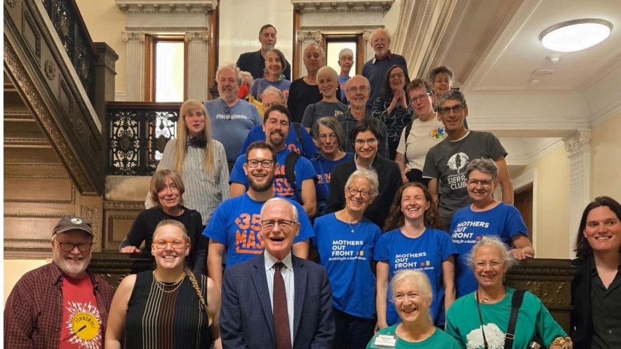
Advocates at the State House last week.