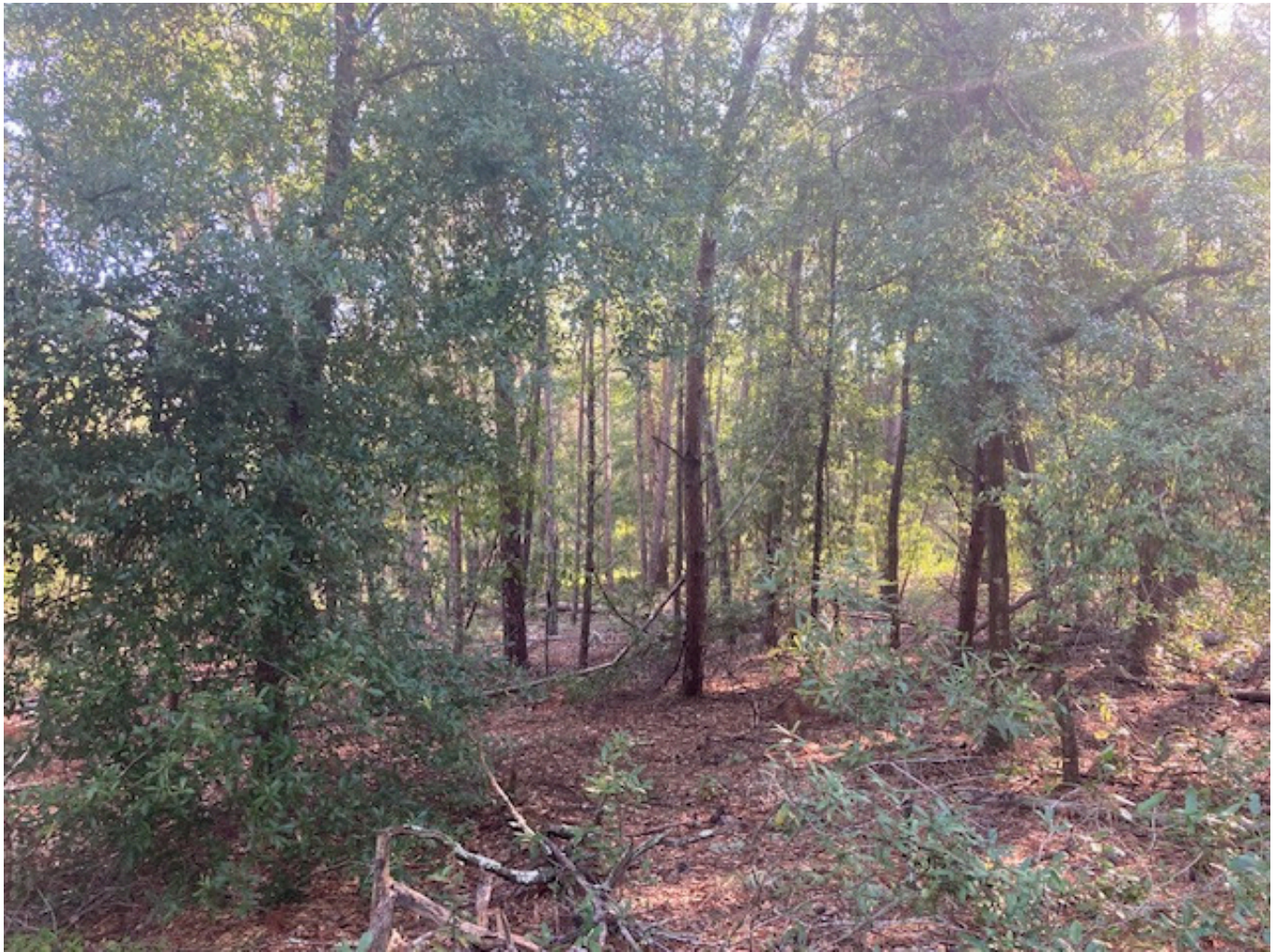
Withlacoochee State Forest parcel earmarked for land swap

On the heels of an ill-advised effort by the Florida Governor to develop golf courses and resorts on public conservation lands that has been dropped due to widespread public opposition, there's more. This past June, without any public input, nor any discussion on the part of its members, the Florida Governor and Cabinet voted to approve transfer of 324 acres of land within the Withlacoochee State Forest in Hernando County to Cabot Citrus OpCo LLC, a Canadian corporation.