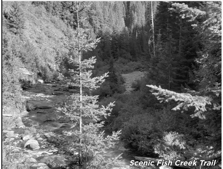
Scenic Fish Creek Trail