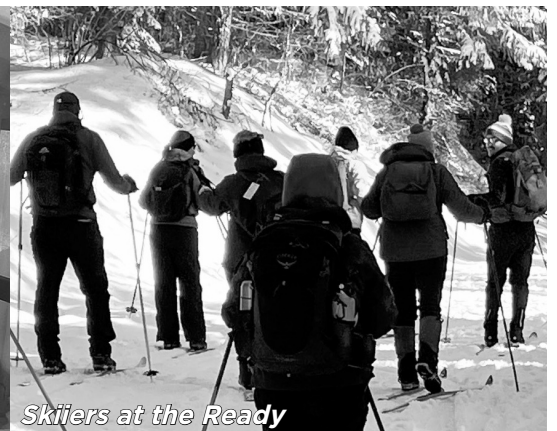
Skiers at the Ready