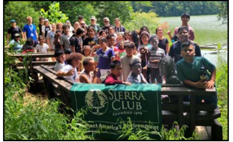
Children in the Nashville area take a break during a hike in Radnor Lake State Park organized by the Sierra Club's Inspiring Connections Outdoors.