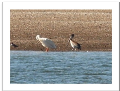
BROWN PELICAN

You may contact Elaine at vevado@yahoo.com.