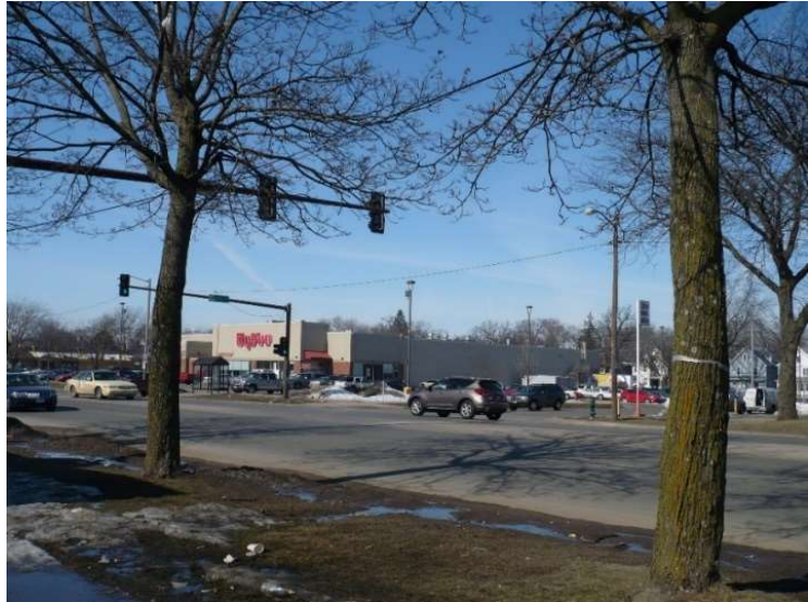
A successful TIF project in Cedar Rapids provided a grocery store to an inner city neighborhood.

An example of a well-designed TIF project is the Cedar Rapids HyVee grocery store located in the inner city – an area that would have been without a grocery store. Without the grocery store, the nearest grocery stores would have been several miles away from the neighborhood and not very accessible to the residents. 4