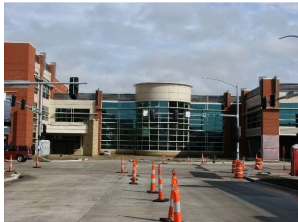
A medical office building in Cedar Rapids that was granted TIF. As a result, the project closed a major city street. What's more, the relocated business had fewer employees. Additionally this project replaced housing in a low-income and minority neighborhood.

When a developer goes to the city and gets tax increment financing, via a TIF bond the city borrows the money from the bond market in the form of a TIF bond. The borrowed money is given to the developer for the project. After the owner of the TIF'ed property pays the property tax on the TIF'ed portion of the property, the city uses that property tax to pay the loan (TIF bond). After the TIF bond is paid for, the