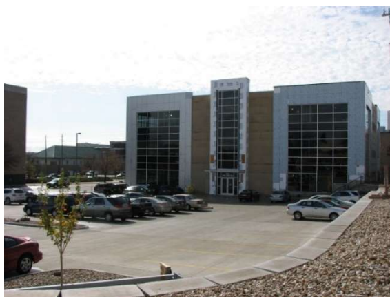
A TIF project in Cedar Rapids, Building developer Steve Emerson decided to ask for TIF after the building was already under construction.

Although originally designed to encourage developers to rejuvenate blighted properties 8 , developers, city councils, and bond issuers have become quite creative in how TIF is used. Between 2000 and 2012, 8.1 billion dollars was spent in tax-increment financing in Iowa. Only 11 percent was for rejuvenating blighted areas, whereas the rest was spent on economic development. 9 In fiscal year 2017, "less than 20.0% of the TIF Taxing Districts were created with slum and/or blighted conditions as a reason for the need to create the District. The majority (64.1%) of TIF Taxing Districts in Iowa were created on the exclusive finding of economic development need." 10