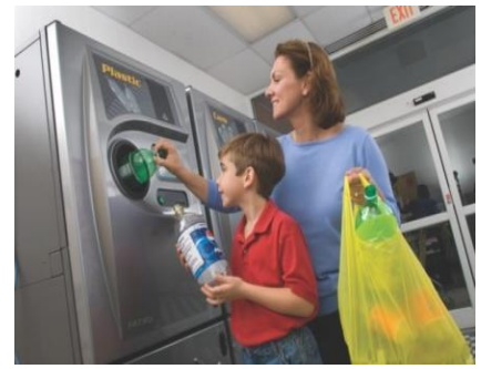
A reverse vending machine

The program would be operated by a nonprofit Beverage Container Stewardship Organization representing all producers that sell beverages in the state. MDE would select the Organization and provide substantial oversight, approving stewardship plans and annual reports and setting the programs' convenience standards and handling fees. An Advisory Council of stakeholders would advise MDE on plan approval, implementation, and performance. The program would be self-financing from fees paid by producers, revenue from the sale of raw materials, unclaimed deposits, and penalties. Ten percent of unclaimed deposits would fund a Grant Program to increase the reuse and recycling of beverage containers.