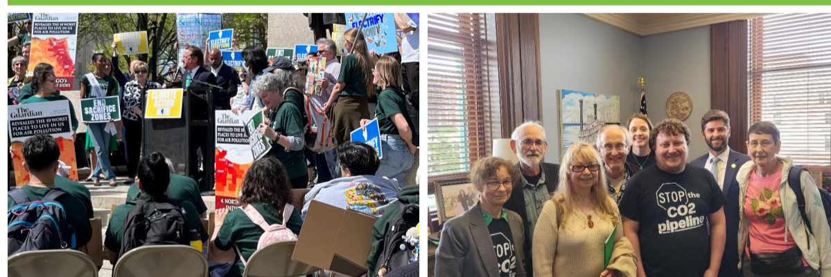
Above: 1) Rally, Climate Change Lobby Day, April 2023. 2) Rep. Ryan Spain office visit April 17, 2024

Every Voice Counts! Make your voice heard today by volunteering with your Heart of Illinois Group Sierra Club. Join us on the front lines of the fight to save endangered wildlife, protect our nation's forests and public lands, defend clean air and water for all, block the fossil fuel industry's destruction, and much more.