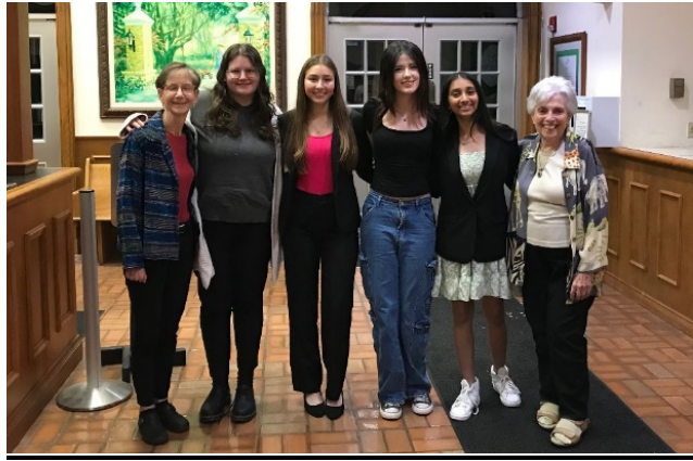
Coconut Creek Commission Presentation And Video (to come) February 22, 2024