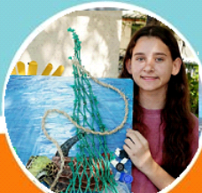
YOUTH ART CONTEST