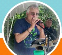
LIVE MUSIC & GOOD FOOD

There's something for everyone at this fun, free, educational and entertaining event!