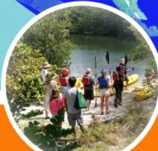
HIKING & KAYAKING