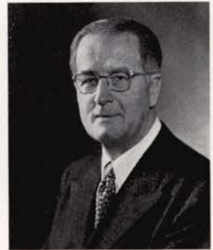
Senator Clinton P. Anderson, Chairman, Senate Committee on Interior and Insular Affairs

Therefore, I say to you that we will proceed with action upon the Wilderness Bill