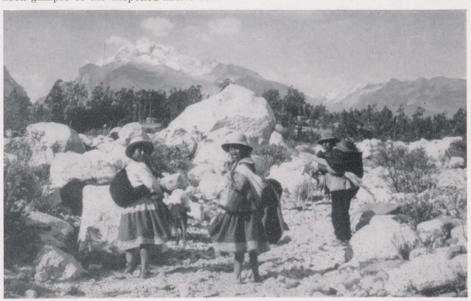
SIERRA CLUB BULLETIN, DECEMBER, 1958