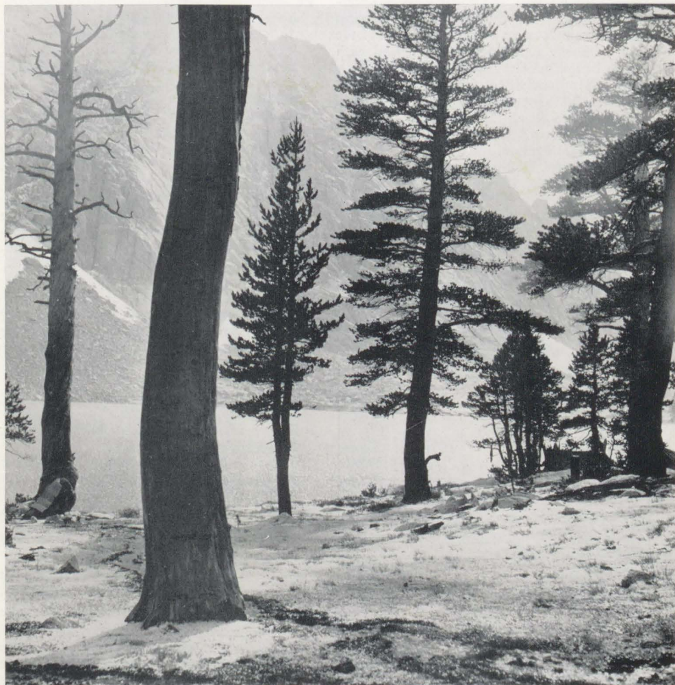
HAILSTORM, CRABTREE LAKES