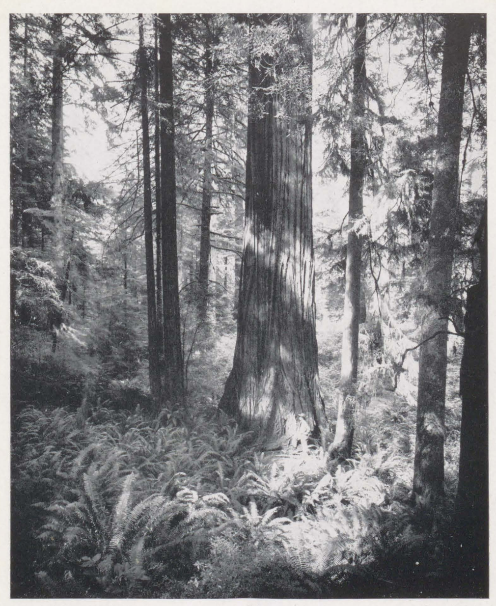
IN THE REDWOODS . . . At Butano-stumps free if we don't succeed . . .