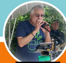
LIVE MUSIC & GOOD FOOD

There's something for everyone at this fun, free, educational and entertaining event!