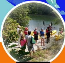
HIKING & KAYAKING!