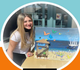
YOUTH ART CONTEST