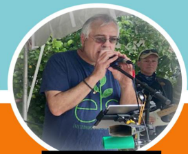
LIVE MUSIC & GOOD FOOD

There's something for everyone at this fun, free, educational and entertaining event!