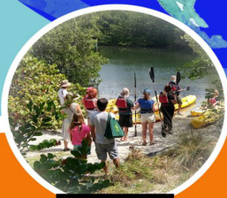
HIKING & KAYAKING!