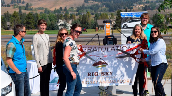
NATIONAL DRIVE ELECTRIC WEEK IN BIG SKY, MONTANA PHOTO CREDIT: MARGO MAGNANT, 2017

Electric Auto Association and locally by many other partners, allow people to organize their own pro-EV events that could include parades, an EV showcase at existing festivals, or just events where people are able swap EV stories with neighbors at a driveway party. The best events include opportunities for test drives as well as for public officials to attend and announce new EV policies.