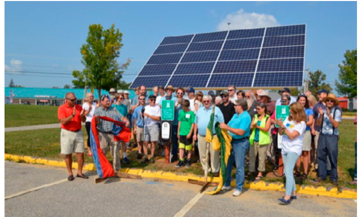
RIBBON CUTTING CEREMONY FOR THE NEW SOLAR POWERED EV CHARGING STATIONS AT OXFORD HILLS HIGH SCHOOL.

electrification should encompass and where stations are needed; they highlight the need and some of the means to intelligently integrate new electricity load with the grid; they emphasize the need to serve all electricity customers, they center consumer protection and open access in the deployment of new infrastructure; and they address the role for electric utilities—underlining that they are critical stakeholders and should have a place in moving transportation electrification forward.