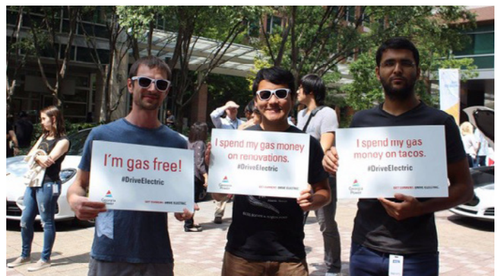
THREE NATIONAL DRIVE ELECTRIC WEEK ATTENDEES AT TECH SQUARE IN ATLANTA SHOW WHY THEY DRIVE ELECTRIC.

This Toolkit makes it clear that we need an all-hands-on-deck effort from government, utilities and transit agencies, and it lays out a full range of actions and policies that are proven to accelerate EV adoption, both effectively and equitably, in any state and local community that wants cleaner vehicles and cleaner air.