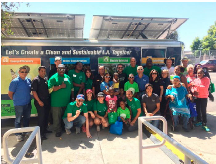
NATIONAL DRIVE ELECTRIC WEEK IN WATTS, CA. 2016.

California: SB 350 was signed by Governor Brown