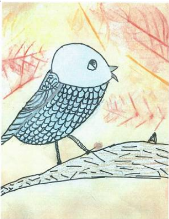
Students learned about and drew birds thanks to a CRSC environmental ed grant.

For spring 2022, CRSC will offer grants of up to $200 each for environmental education projects to schools or community organizations involving young people at the elementary and middle school level within the CRSC region: Crawford, Grant, Jackson, La Crosse, Monroe, Richland, Trempealeau, and Vernon counties.