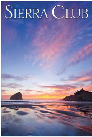
ENGAGEMENT CALENDAR | 2018