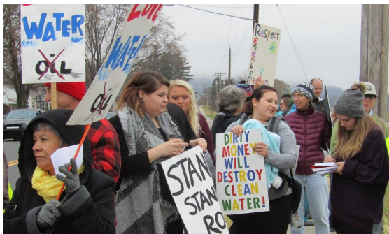
La Crescent NO DAPL Nov. 15

The session was scheduled to last from 5 to 7 p.m. but went to 8:15 p.m. so everyone could speak. The EPA administrators thanked the group for their comments and said that this kind of session was a big help to them in doing their jobs.