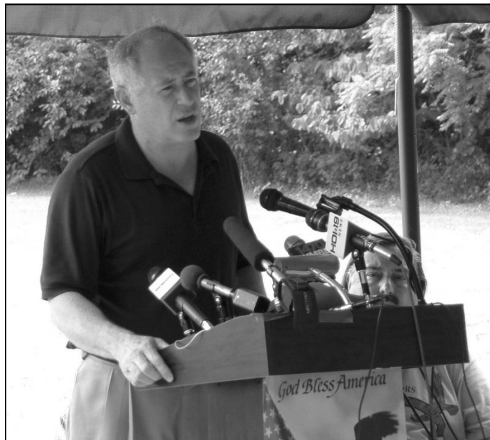
Lt. Governor Pat Quinn speaking for the protection of Banner natural areas on July 18 th.