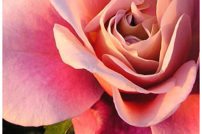
A Rose at Sunset