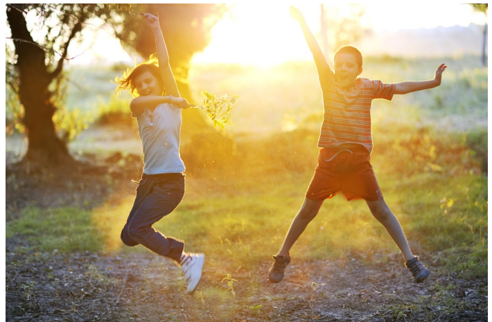
Solar energy lifts life on earth

Check it out at: www.sierraclub.org/solarhomes