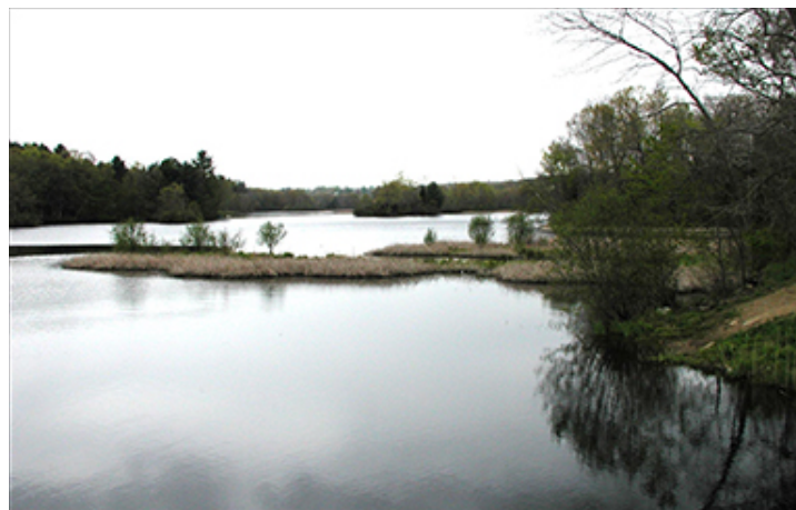
Willimantic River and Eagleville Lake

Access: Carry in paved boat launch at River Park in Mansfield