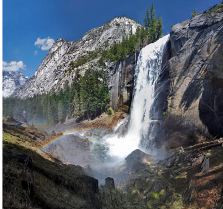
A cascade in Yosemite Park

With Robert Underwood Johnson beside him, John Muir proposed a way to create a national park, a Yosemite National Park to save the area. Johnson was convinced of the value of incorporating the land into a national park and ran two long Muir written articles in Century magazine. Muir wrote about the preservation of our forests, the country's natural resources and its ecosystems. Johnson's publication sparked a bill in the U.S. Congress that proposed creating a new federally administered park surrounding the existing Yosemite Grant. Yosemite National Park became a reality in 1890 covering 1200 square miles. The National Park Service today describes it as, "Not just a great valley, but a shrine to human foresight, the strength of granite, the power of glaciers, the persistence of life and the tranquility of the High Sierra."