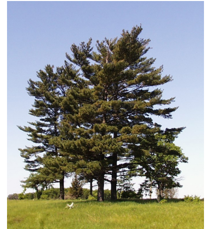
White Pine Tree