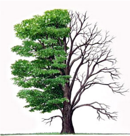
American Chestnut Tree