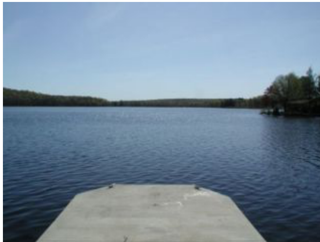
Upper Moodus Reservoir

http://bostonkayaker.com/cgi-bin/bkonekpage.cgi?pagekey=moodus