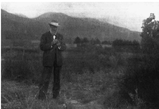
John Muir in Yosemite

The two men camped at Soda Springs, natural springs of clear, carbonated water in Tuolumne Meadows. The location is one of the largest high-elevation meadows in what is now referred to as the Sierra Nevada. The Tuolumne River meanders through the meadow and cascades over the granite river bottom surrounded by rugged mountain peaks and domes carved by glaciers. The Miwok and Paiute Indians accessed this area for thousands of years. The Tioga Road was a trade route through the Sierras, originally called Mono Trail when it linked the Miwok Indian encampments with those of the Paiutes of the Mono Lake region.