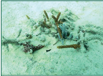
Coral smothered by sediment