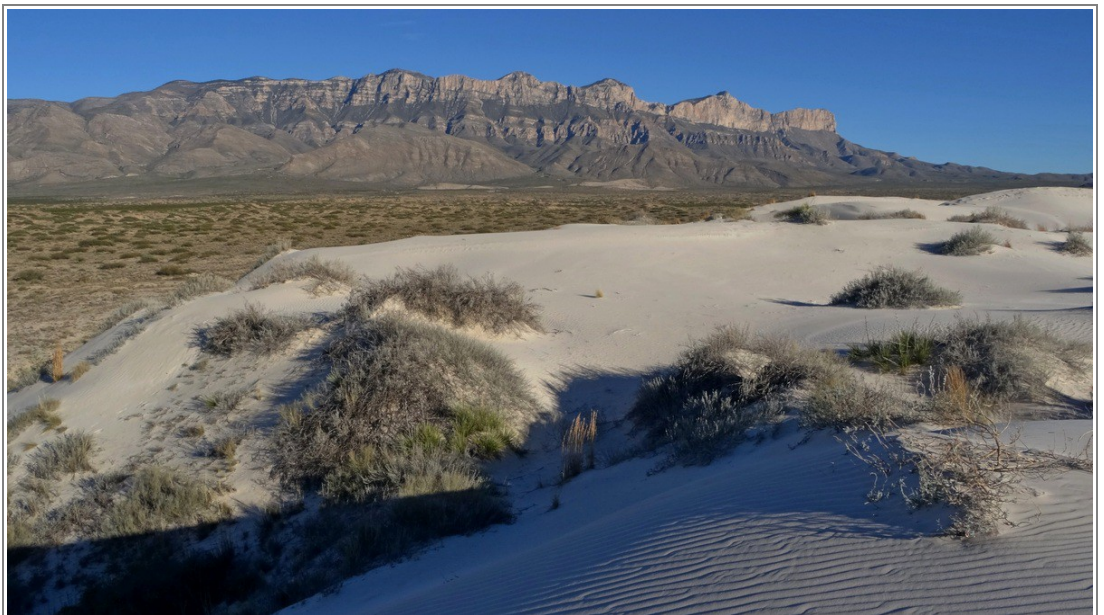
Guadalupe Mountains National Park: the southern end of the mountains and the Capitan Reef from the west. This vista is from the Salt Basin Dunes, a day-use area on the west side of the park. The rightmost peak is El Capitan; the 2nd rightmost is Guadalupe Peak, 8 miles away, at 8749' the highest elevation in TX.