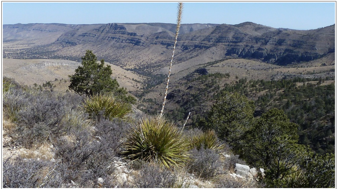
Guadalupe Mountains National Park: view to the NE looking down Dog Canyon from near the west end of the Tejas Trail. The Dog Canyon campground and north entrance to the park is in the canyon, visible upper center. Guadalupe Peak is 6 mi directly behind, to the SSW.

#1-Black Canyon of the Gunnison in Colorado, #2-Petrified Forest in Arizona, #4-Great Basin in Nevada, and #6-Capitol Reef in Utah. Maybe we can visit those in future articles.