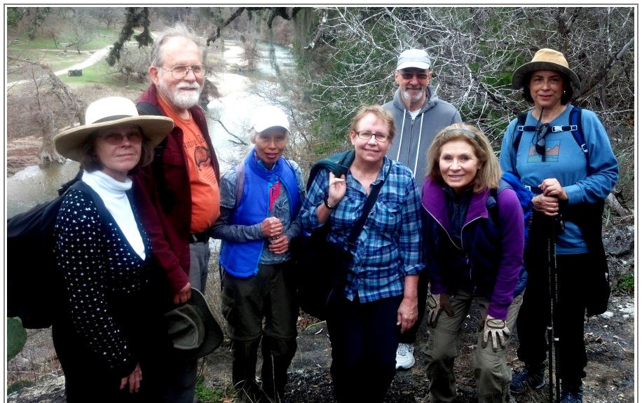
Hikers at the Alamo Group Guadalupe River State Park outing December 20 th.

Outings have always been a core Sierra Club function since 1892, when the Club was founded by John Muir. The Club published a book on the outings in 1988, History: Origins and Early Outings ; you can read extracts from each chapter at this link. There is a picture of John Muir at the Merced River in Yosemite. From chapter 1: "The advice to 'climb the mountains and get their good tidings' has been followed by Sierra Club members since the organization's start, and the pursuit of this goal has