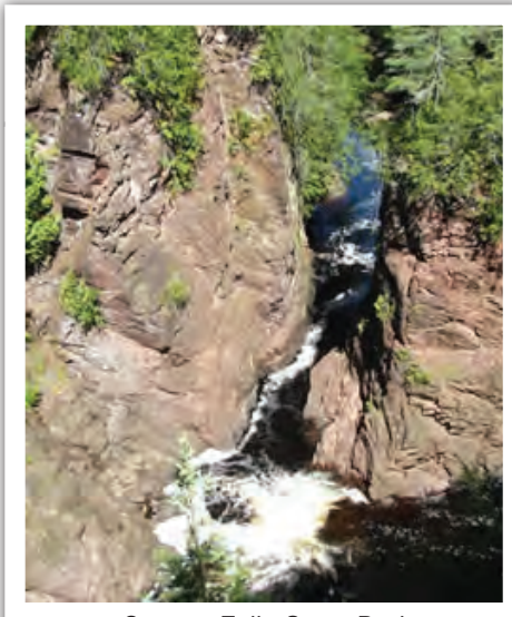
Copper Falls State Park

Grunerite, an asbestiform mineral, represents a known public and wildlife health hazard. It is one of several fibrous minerals like asbestos (Asbestos is a trade name for similar mineral fibers used in industrial applications such as insulation). mineral fibers maintain their needle-like shape when crushed or broken up and can cause the cancer Mesothelioma if inhaled. This spring, DNR staff found a sample of grunerite at the mine site. This fall, Professor Tom Fitz of Northland College found multiple sites where grunerite was exposed in the outcrops on the Penokee mine site.