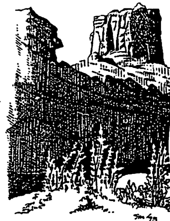
Escalante River at Haines Wash