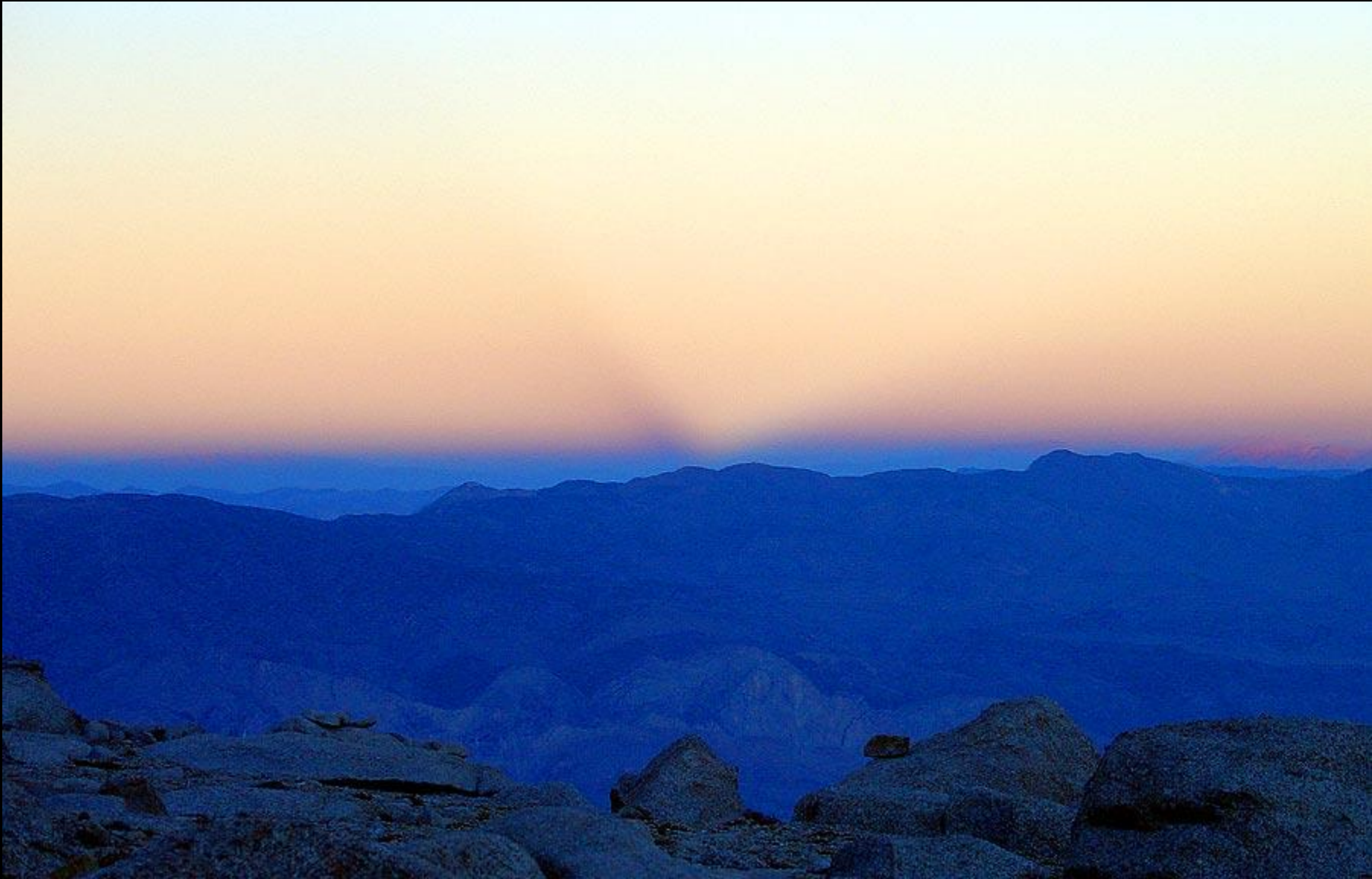
5.16-Evening light after sunset in the East with shadows from Mt Whitney.