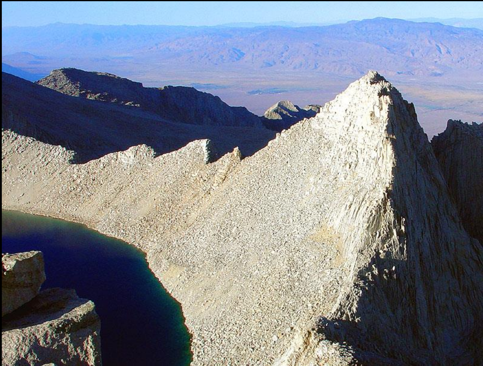
5.9-Climbed The Cleaver east of Lake Tulainyo.