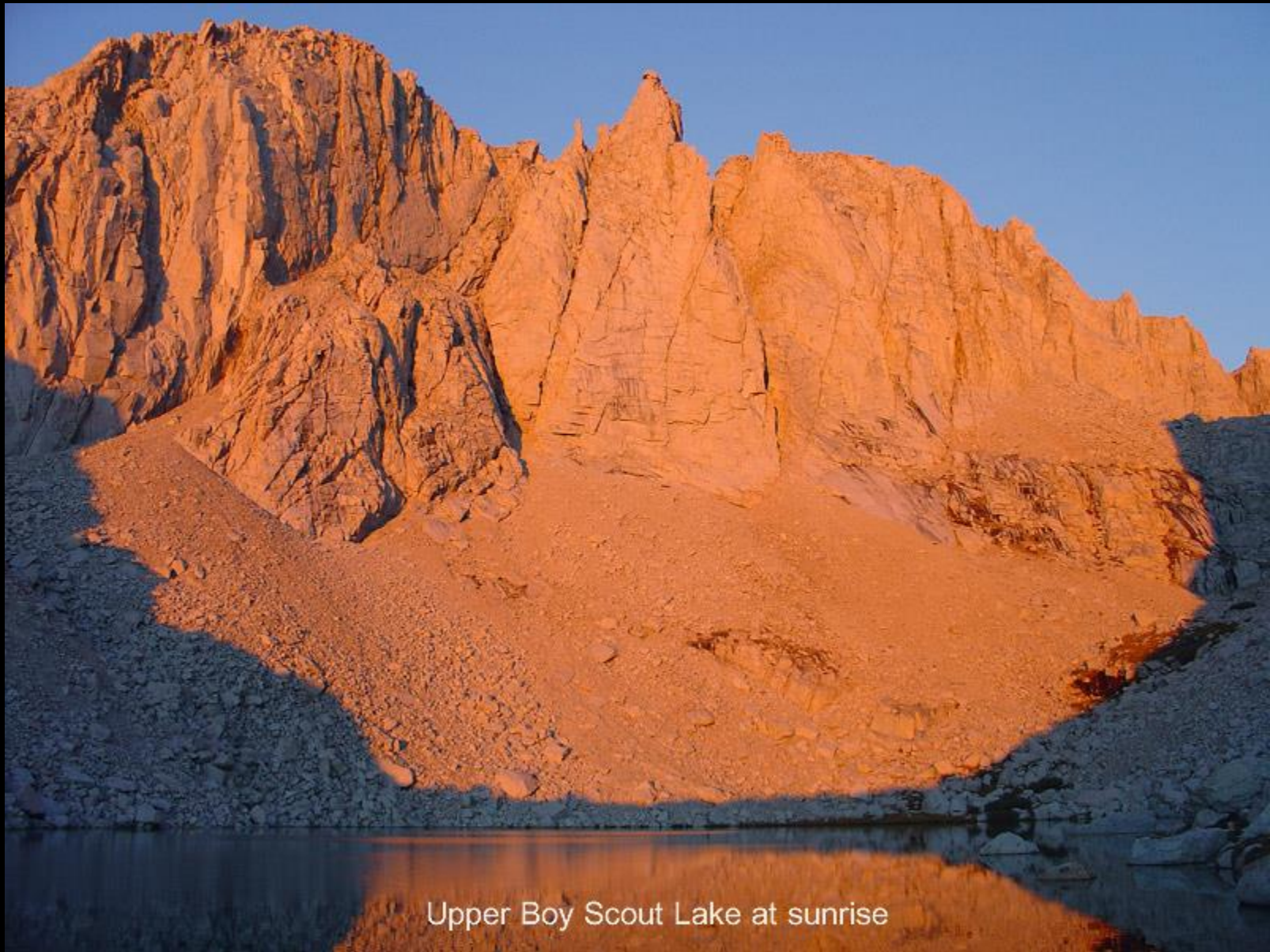
Upper Boy Scout Lake at sunrise

5.8-First sunlight at basecamp before climbing Mt Carl Heller.