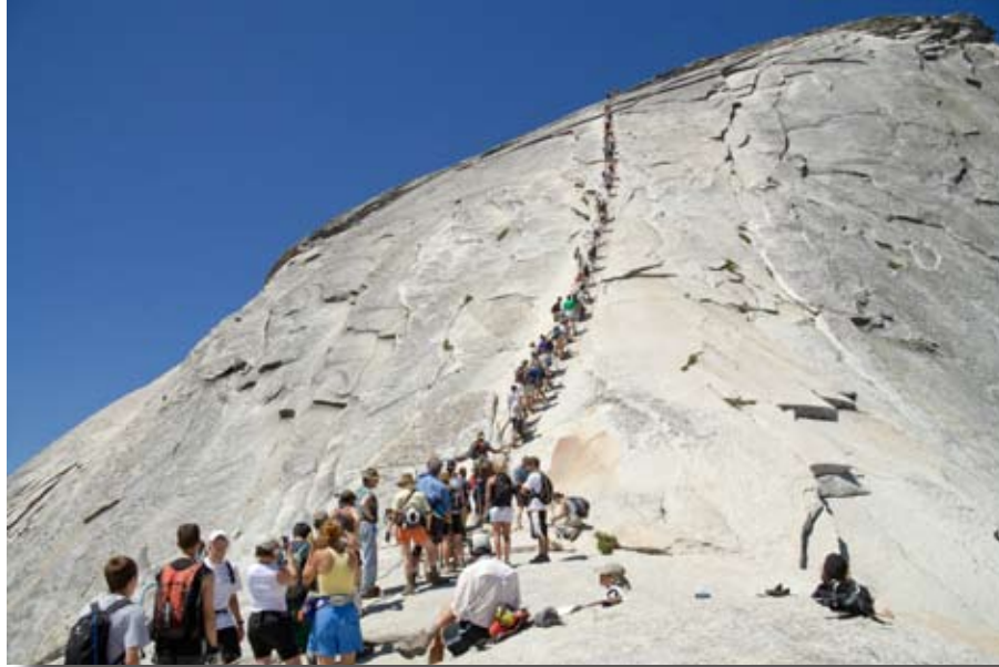
Cables crowd