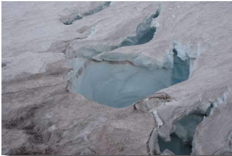
Line of crevasses below Camp Schurman

Fortunately, the wind moderated to sub-gale force in the late morning and we were able to