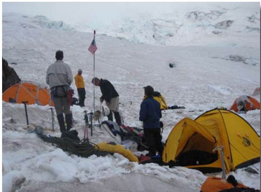
The Stars and Stripes at Camp Schurman

Weather conditions didn't help my physical state. It was frigid