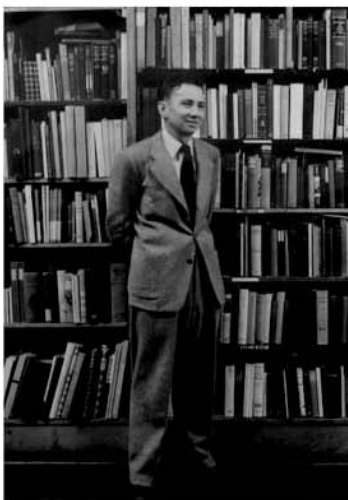
The quintessential bookman at his post in Dawson's Bookshop, c.1950

Entree Choice: Chicken - Salmon - Cobb Salad - Vegetarian