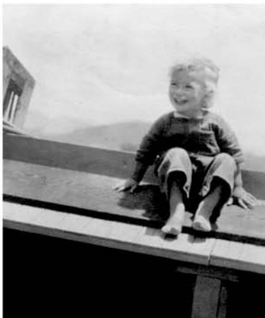
Climbing Mount Washington rooftop, c. 1916

Bookman - Publisher - Mountaineer - Soldier - Family Man - GENTLEMAN