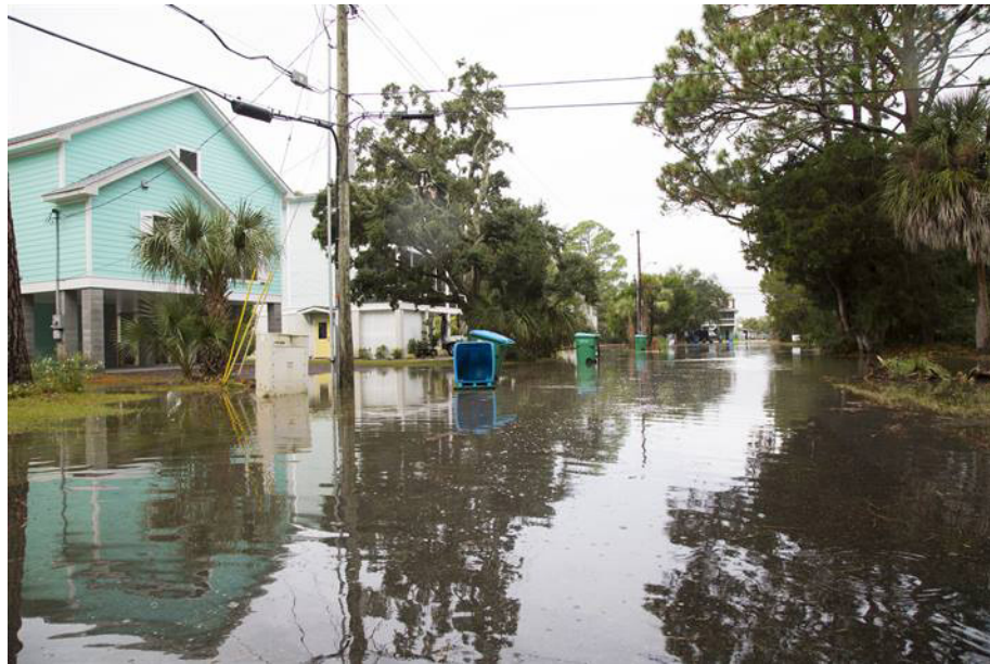
Flooding on Tybee Island in October 2015.

NOAA has documented a long-term trend of increasing nuisance flooding on Tybee Island and the Savannah area as a clear consequence of rising seas. Compare the 4.8 average number of observed nuisance flood days in the four-year period 1956-60 to the 13.2 average number of such days during the period