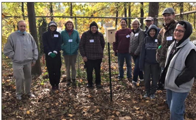
Centennial Group members pose near a birdhouse on the Riverline Trail, a group project (left), and on Blood Mountain (right) after an outing.

We are proud of the support from Centennial Group