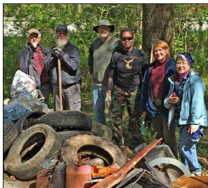
GWINNETT GROUP VOLUNTEERS

The Outstanding Group Award recognizes one of our Local Groups for their recent efforts in their community.