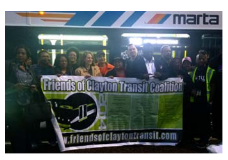
Members of the Friends of Clayton Transit coalition at the inaugural Clayton County MARTA bus trip in March

While the legislature continues to disappoint on transit, developments at the local level are much more encouraging. MARTA shows continued progress