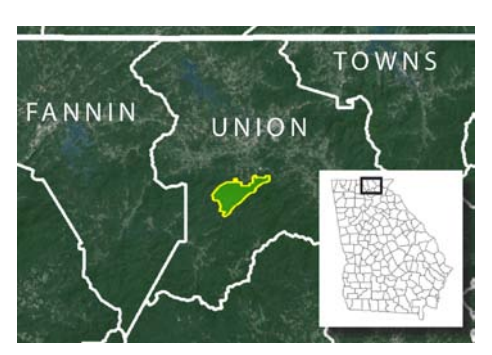
Saving old-growth forests in the Cooper Creek Watershed remains a top priority for the Chapter's Wildlands & Wildlike campaign

The committee expects to see a revised proposal this fall when the Forest Service is scheduled to release a draft Environmental Assessment for the project. Forest Service employees have said the revision will include fewer acres to be cut, but such statements are cold comfort when many of the treatments laid out in the original proposal are designated as inappropriate by the Forest Service's own management plan for the Chattahoochee National Forest. Unless the revision shows vast improvements, the committee will continue its work to tell the