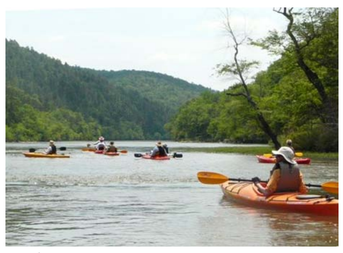
Scene from a recent LaGrange Group Outing