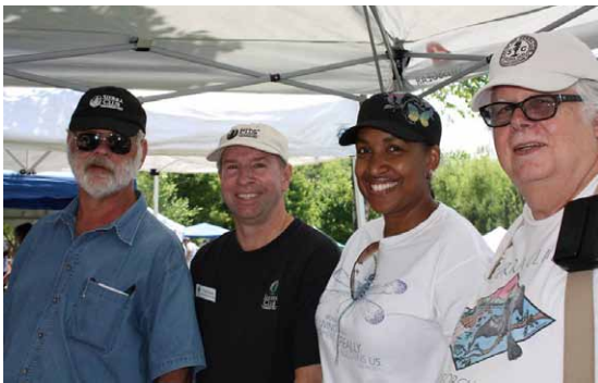
Centennial Group volunteers at Chattahoochee River Race Festival in June.