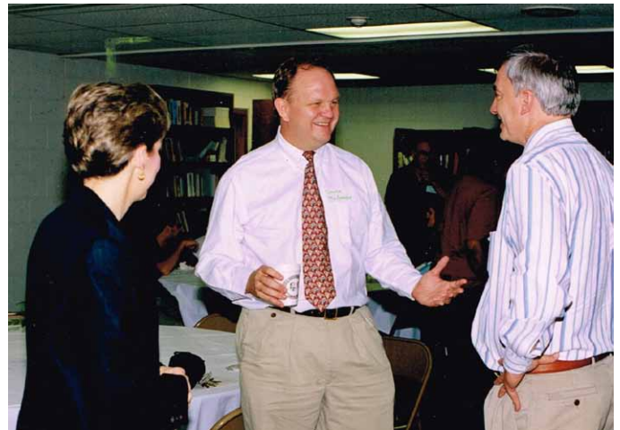
The author (center), circa 1998.

The Club's southern chapters hadn't liked the process used to make that endorsement, and part of the problem was that no Sierra Club members who were Republicans were involved in the process. The San Francisco-based political leaders weren't enthusiastic about adding Southerners or Republicans