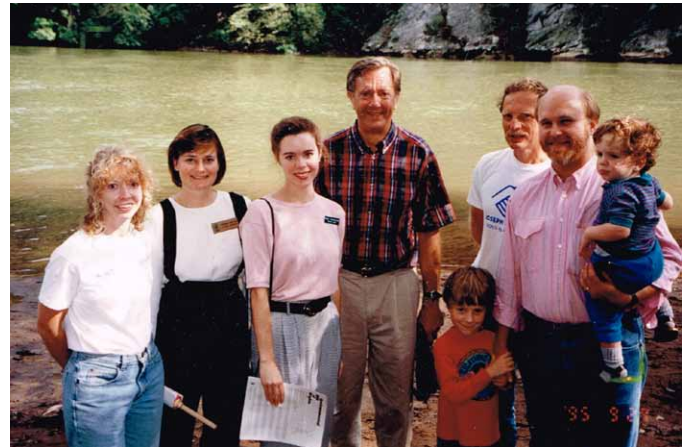
The author (3rd from right) with U.S. Interior Secretary Bruce Babbitt (center) and other Sierrans during a 1995 visit to the Chattahoochee National Recreation Area.

The next morning we received calls from Andy Young and Sam Nunn asking if we could participate in their campaigns.