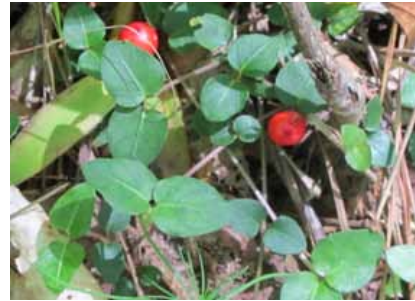
Edible Partridge Berry photographed on one of our outings to Mistletoe State Park in April and May. (No, it isn't very tasty!)

Our summer outings will feature a July 3 Phinizy Swamp full moon walk from 9pm-11pm. Also in July we will go spelunking (caving) at Sinking Cove in Alabama, one of the best caves in the region.