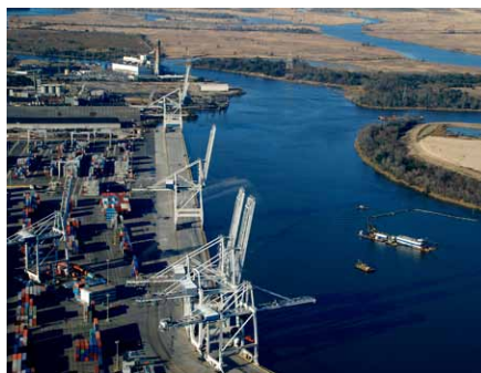
The existing Savannah River port, which state leaders seek to drastically expand.

Resources, and its Environmental Protection Division, continue to struggle along, having absorbed a string of budget cuts that began during the "fat years" of the Miller administration and have continued, with few interruptions, ever since. "Trust Funds" that are supposed to be used to clean up used tire dumps, old landfills and hazardous waste sites have been regularly looted by Governors and Legislatures, and are forced to work with mere fractions of the monies collected under their authority. This is why we now have numerous tire dumps decorating remote countryside and urban watercourses.