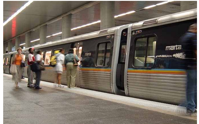
Local control for MARTA is expected to a contentious issue again.

The 2012 Session may, or may not take up the question of shifting the date of the T-Splost referenda from July to Novem-