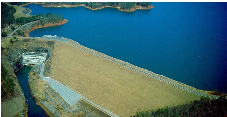
Buford Dam at Lake Lanier. Could new reservoirs be on the way?

Because of all of the pressure to “do something” the State Water Plan, (which has just now been completed), after a