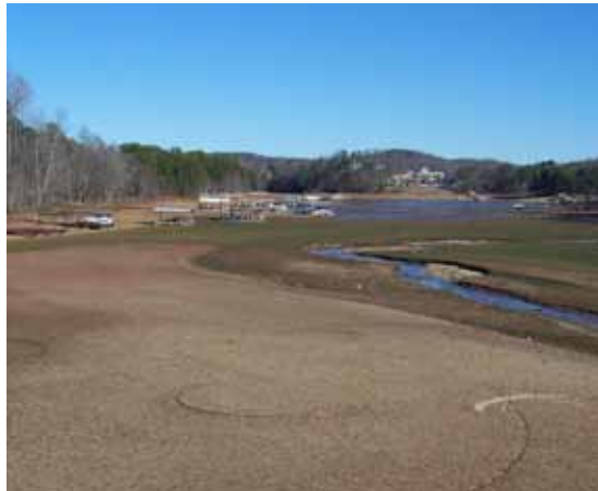
Lake Lanier at the height of the 2008 drought

3) GA needs to fully utilize existing reservoir storage capacity to meet new supply requirements, expanding those lakes where needed.