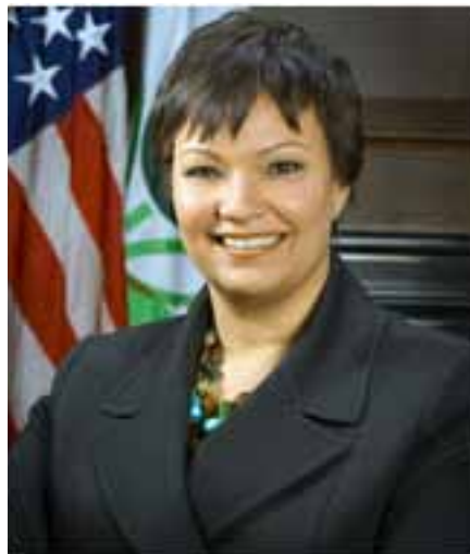
Under new administrator Lisa Jackson, the EPA has pursued more aggressive regulations on CO 2 , mercury, and other pollutants.

ting a lower level of permissible ozone. On January 6, 2010, EPA proposed to strengthen the national ambient air quality standards for ground-level ozone. The EPA is proposing to strengthen the 8-hour “primary” ozone standard, de-