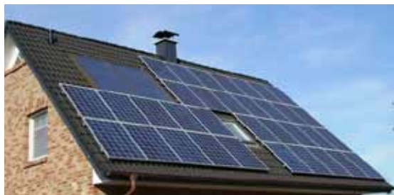
A rooftop solar photovoltaic (PV) system

If you want to demonstrate leadership in renewable energy, and you are serious about clean air, water resources, and energy independence, then there is another option for you – install a solar photovoltaic (PV) system directly on your home, business or property. You will receive a 30% Federal cash rebate within 60 days of application to the