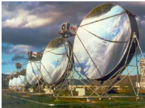
Will “solar-only” soon be an option for Georgians?

The Georgia Chapter enthusiastically supports the “solar-only” option. Solar energy is the most widely available renewable energy resource in Georgia. The production of energy results in no air pollution emissions and no water use. Solar energy is the most deserving of receiving support from our “green energy dollars,” since Georgia Power currently pays less for landfill gas than they do for the average of the rest of their fuel mix.