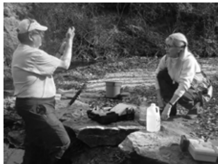
Group volunteers do chemical testing on Betty's Branch in Columbia County

fects. Can you imagine volunteering to collect three months worth of garbage and trash in your garage to demonstrate