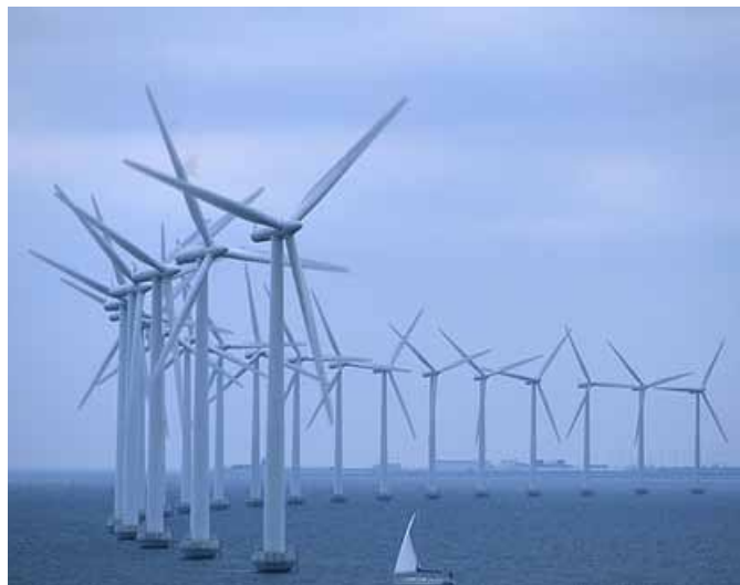
Offshore wind power: part of Georgia's energy future?

What did we learn from the conference? First, that all of the Northeast Atlantic Coast States are chomping at the bit to get the first great Washington Monument-sized, up to 5 Megawatt, wind turbines "in the water." The United States is already behind European off-shore wind installation by decades, and forward looking Americans are determined to stop this decline. The European Economic Union expects to generate 10% of all its electricity from off-shore wind when current projects already under development are completed and front runners like Denmark plan to generate 50% of their electrical needs from off shore wind by 2020. The United States has huge off shore