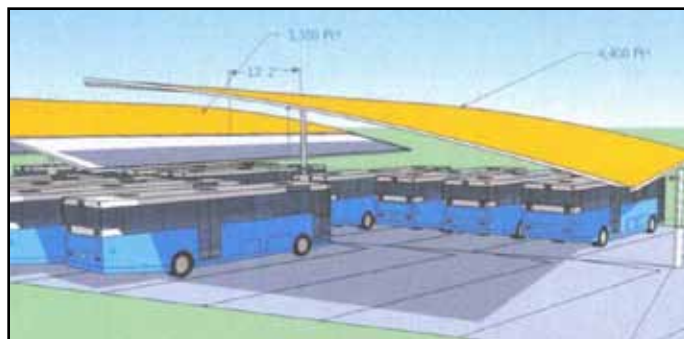
An artist's rendering of the proposed Laredo Solar Canopy

As part of its sustainability initiative, MARTA became a signatory to the American Public Transportation Association's (APTA) Sustainability Program. This nationwide pilot program calls on MARTA and other signatories to take pro-active steps to preserve the environment for current and future generations, to be socially responsible and to maintain economic viability.