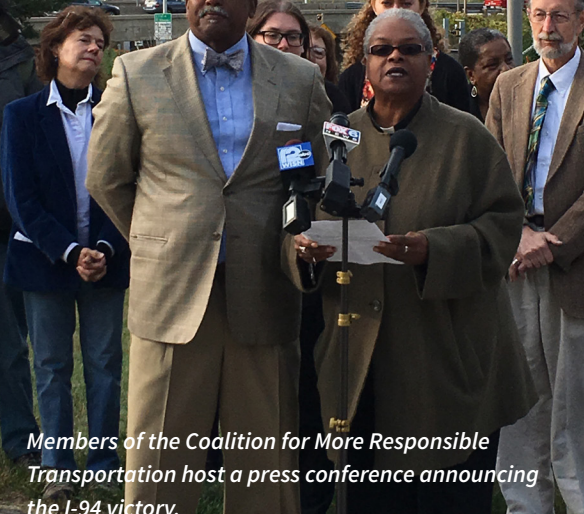
the I-94 victory.

Wisconsin couldn't afford it, and the future didn't need it. The cities of Milwaukee and Wauwatosa both passed resolutions opposing the I-94 East-West expansion. Milwaukee County called for the funding for the project to be used on improving transit and fixing potholes instead of unnecessarily widening a highway, which would disproportionately impact communities